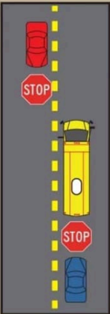
TWO-LANE: Vehicles traveling in both directions MUST stop.